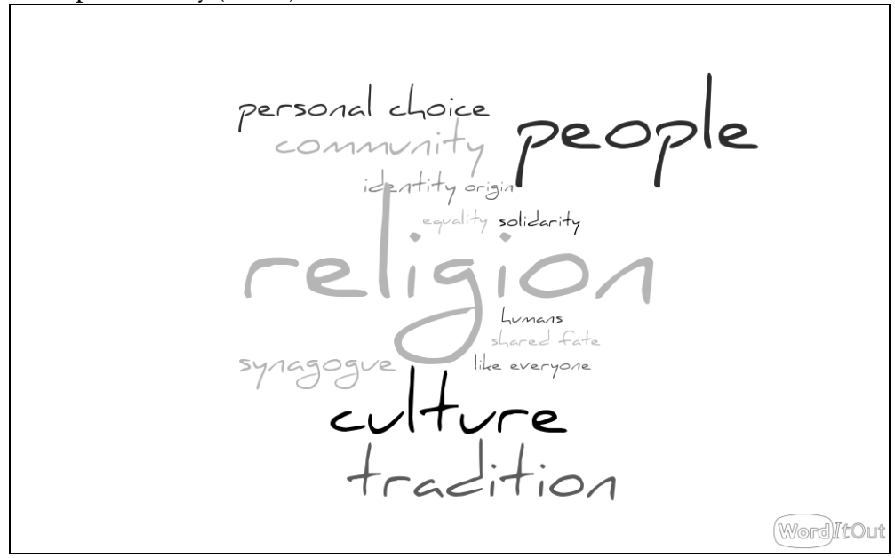
Figure 2: Aggregated wordcloud based on all words that occurred three times or more, post-activity (n=238)^*